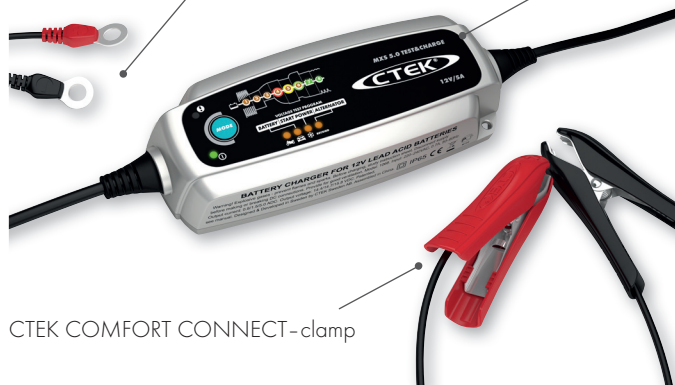
CTEK COMFORT CONNECT-clamp

Complete battery care – unique and patented system to recover, charge and maintain all lead-acid battery types to maximise performance and extend life.